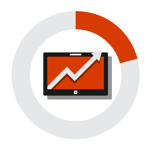
Use of personal devices for work increased productivity