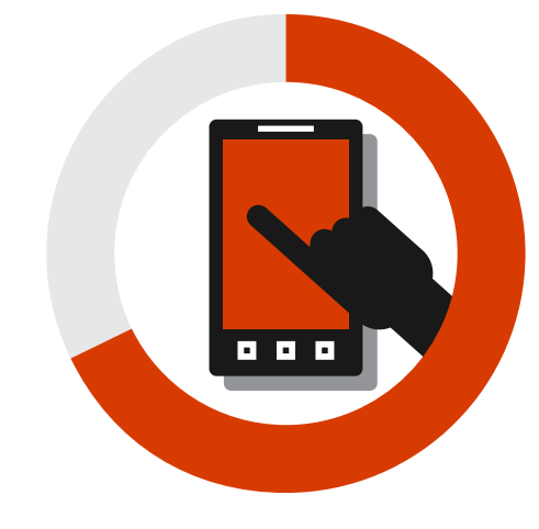
Personal devices available for work purposes